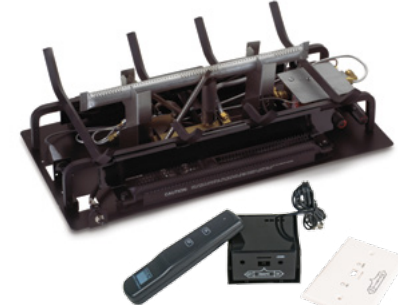
G9-2-20/24/30-12 See-Thru Gas Burner with on/off remote